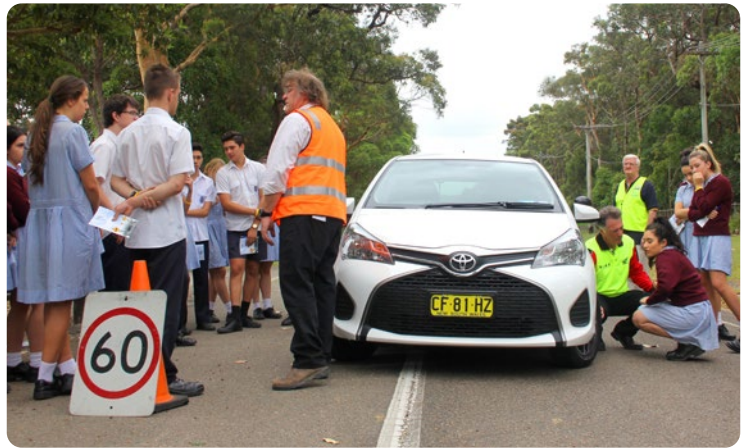
Above: Road Safety Education Program being delivered to school students.

Since inception GCC has provided 806 grants totalling $2,263,348. This past year saw $116,073 invested into the region over 52 grants.