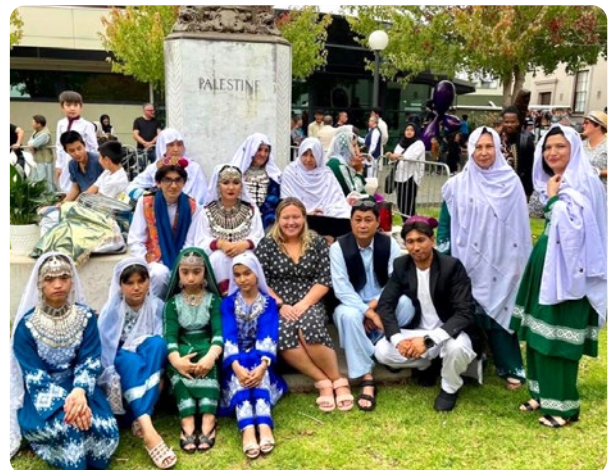
Above: Hazara Community Geelong on performance day.