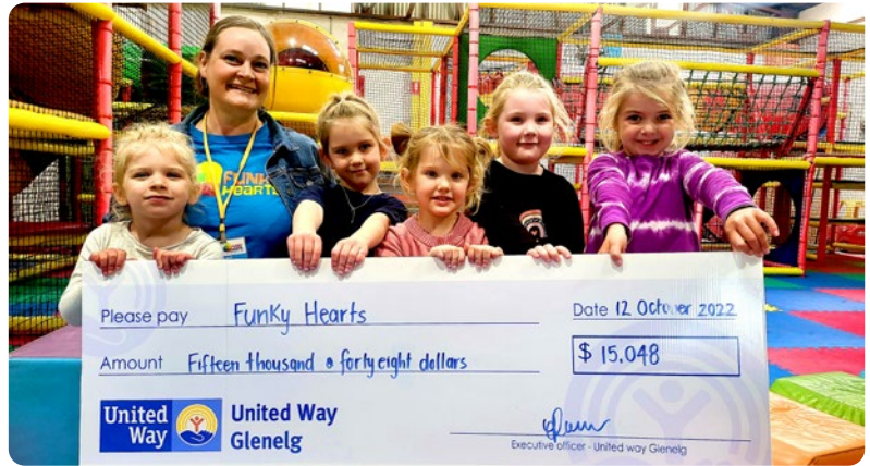
Above: The smiling faces at Funky Hearts excited to receive the funds raised from the 2022 Shark Pitch event.

The primary objective of the workshops is to confront the critical issue of the sexualization of young people. Designed to provide students, educators, and community members with essential insights and effective strategies to address this concern. The sessions made a significant contribution to equipping our community with valuable knowledge and tools to navigate this important issue.