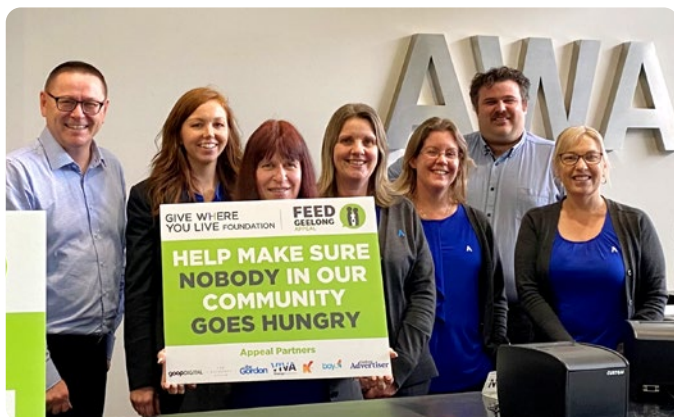
Above: AWA staff supporting the Feed Geelong Appeal.