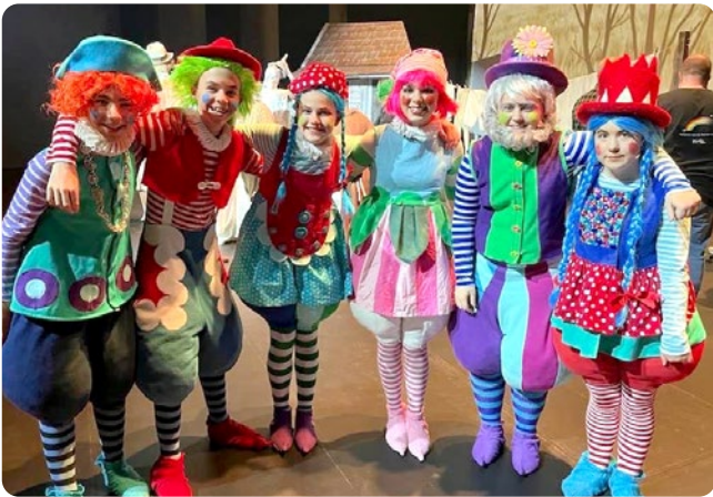
Above: GSODA Junior Players ready to perform the Wizard of Oz.